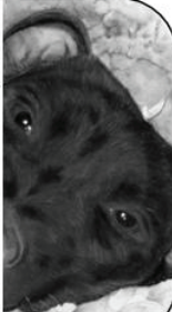
from 'Sakura' 2010

Quality, handmade works of art that reflect the unique spirit of your animal friends, living or deceased.